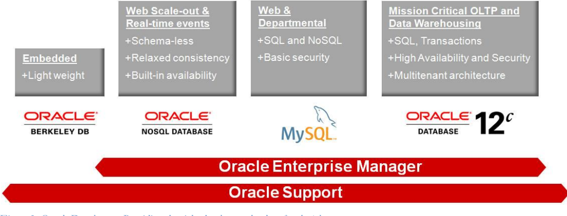
Figure 2: Oracle Databases - Providing the right database technology for the job