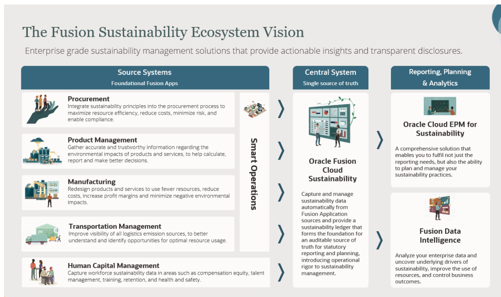
Figure 4: The Fusion ecosystem for sustainability management

That's the Oracle sustainability advantage—built-in, not bolt-on.