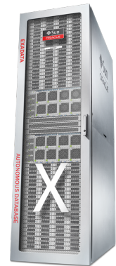
Oracle Exadata Database Machine X8M-8

The Oracle Exadata Database Machine is engineered to deliver dramatically better performance, cost effectiveness, and availability for Oracle databases. Exadata features a modern cloud-enabled architecture with scale-out high-performance database servers, scale-out intelligent storage servers with state-of-the-art PCI flash, leading-edge storage cache using persistent memory, and cloud scale RDMA over Converged Ethernet (RoCE) internal fabric that connects all servers and storage. Unique algorithms and protocols in Exadata implement database intelligence in storage, compute, and networking to deliver higher performance and capacity at lower costs than other platforms, for all types of modern database workloads including Online Transaction Processing (OLTP), Data Warehousing (DW), In-Memory Analytics, Internet of Things (IoT), as well as efficient consolidation of mixed workloads. Simple and fast to implement, the Exadata Database Machine powers and protects your most important databases. Exadata can be purchased and deployed on premises as the ideal foundation for a private database cloud, or it can be acquired using a subscription model and deployed in the Oracle Public Cloud or Cloud at Customer with all infrastructure management performed by Oracle.