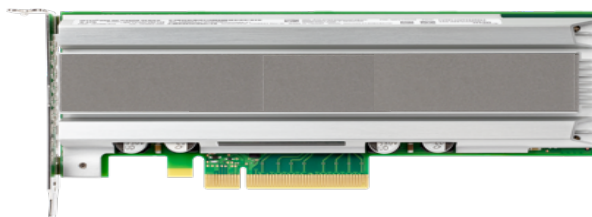
Figure 3. Flash Accelerator PCIe Card

These are real-world end-to-end performance figures measured running SQL workloads with standard 8K database I/O sizes inside a single rack Exadata system, unlike storage vendor performance figures based on small I/O sizes and low-level I/O tools and are therefore many times higher than can be achieved from realistic SQL workloads. Exadata's performance on real database workloads is orders of magnitude faster than traditional storage array architectures, and is also much faster than current all-flash storage arrays, whose architecture bottlenecks flash throughput.