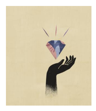
Industry Leader in signaling since

Oracle Communications EAGLE is an innovative and sturdy common signaling platform that extends signal transfer point (STP) and serving gateway (SGW) assets to long-term evolution (LTE), machine to machine (M2M) and Wi-Fi domains for enhanced efficiency, connectivity and newer revenue models.