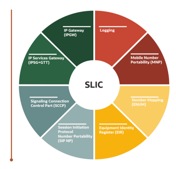
Figure 2. Oracle Communications SLIC functionalities