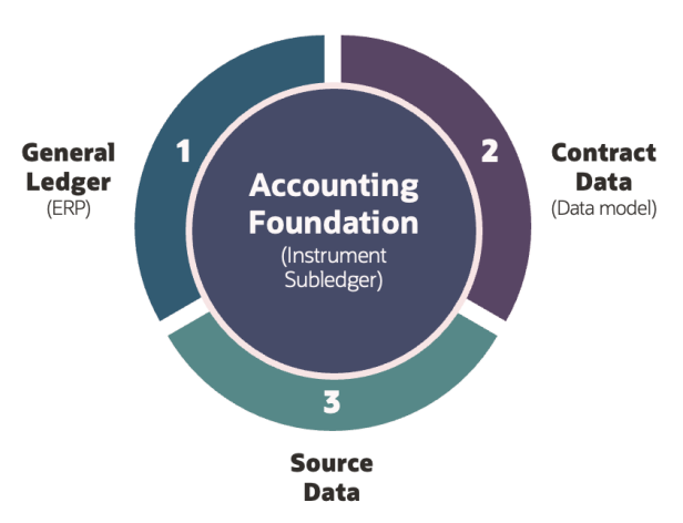
2 Oracle Financial Services Accounting Foundation Version [1.0] Copyright © 2025, Oracle and/or its affiliates / Public

Figure 1. Accounting Foundation conducts three-way data reconciliation, with the ability to reconcile general ledger balances with large volumes of granular data and transactions.