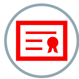
A strict adherence to best practice

Get this mix right, and you'll be able to understand the flow of data through your organization like never before—viewing the complete data life cycle, managing risk and compliance, and confidently driving your business forward.