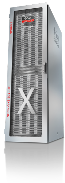
Oracle Exadata Storage Expansion X8M-2

Disclaimer: This document is for informational purposes. It is not a commitment to deliver any material, code, or functionality, and should not be relied upon in making purchasing decisions. The development, release, timing, and pricing of any features or functionality described in this document may change and remains at the sole discretion of Oracle Corporation.