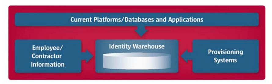
Figure 2. Step 2 is to build the entitlement warehouse, a repository for HR profile data for users.

this may be done for a handful of applications or for one large application such as an enterprise resource planning (ERP) system.