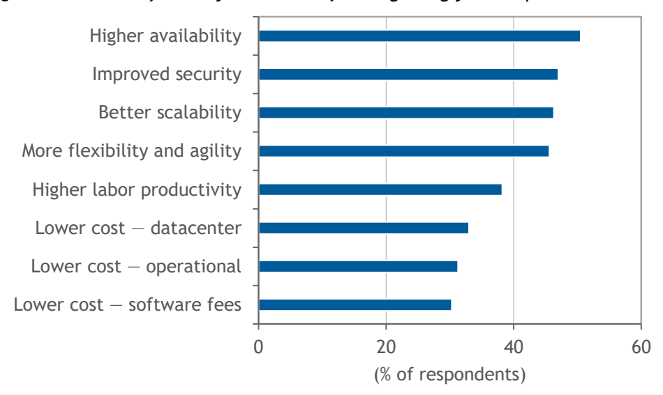
n = 406

Q. What benefits did you achieve after migrating your on-premises databases to the cloud?