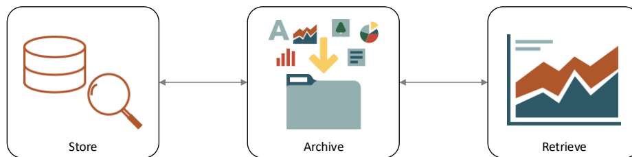
Figure 2 How Oracle Utilities LEC Historian Connector works

Oracle Utilities LEC InfluxDB Adapter is readily available as an operational historian integration to Oracle Utilities LEC. Combined with LEC's flexible architecture this fully integrated solution allows system and device data time-series data to be stored, archived, and retrieved in real-time.