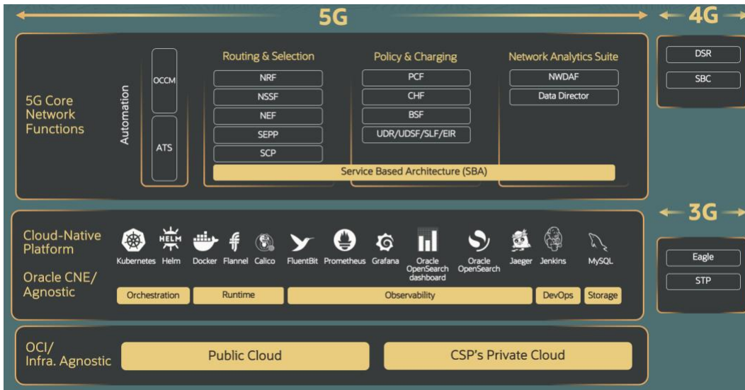
Image 2. Oracle Communications Cloud Native Core Network Functions Deployment Stack.

Deploy trusted, cloud native 5G technology from the network through BSS and OSS applications. Take advantage of automation in the 5G standalone core to bring new services to market faster.