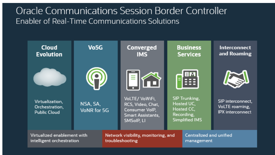
Image 1. Enable Real-Time Communications Solutions with Oracle Communications Session Border Controller.