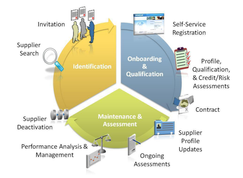
Figure 1: The Lifecycle of a Business Relationship with a Supplier

Synchronize Questionnaire Responses with