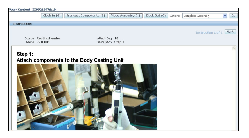
Figure 2. Sequential display of instructions in the work content page guides operators in performing their work

The detailed work content can be configured to display the information necessary for a job operation, such as sequential display of work instructions, information on components, and resources required to perform the operation.