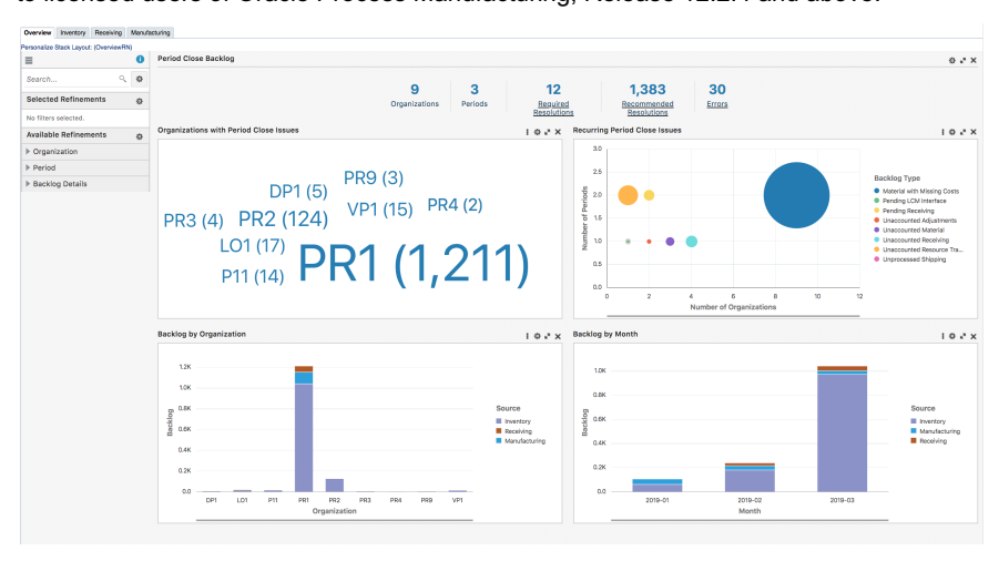
Figure 2: Overview Dashboard in Oracle Cost Management Command Center

The Oracle Cost Management Command Center feature is available at no additional cost to licensed users of Oracle Process Manufacturing, Release 12.2.4 and above.