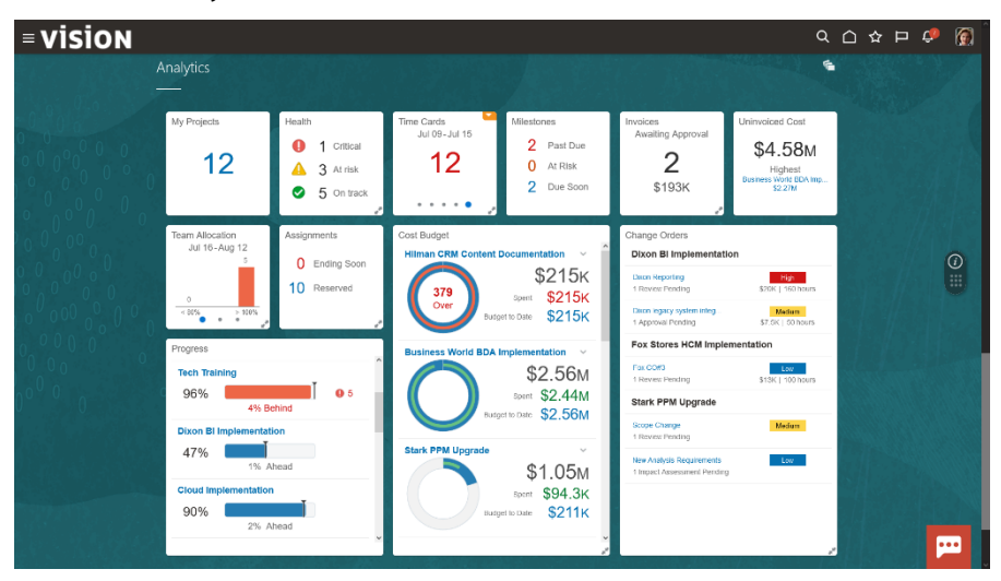
Figure 3. Self-Monitoring Projects Alert you to Exceptions

degradation in performance and bring to attention projects with ongoing or escalating issues, along with any trends to be aware of. Without leaving the dashboard, project managers can quickly access the originating transactions and immediately take corrective action.