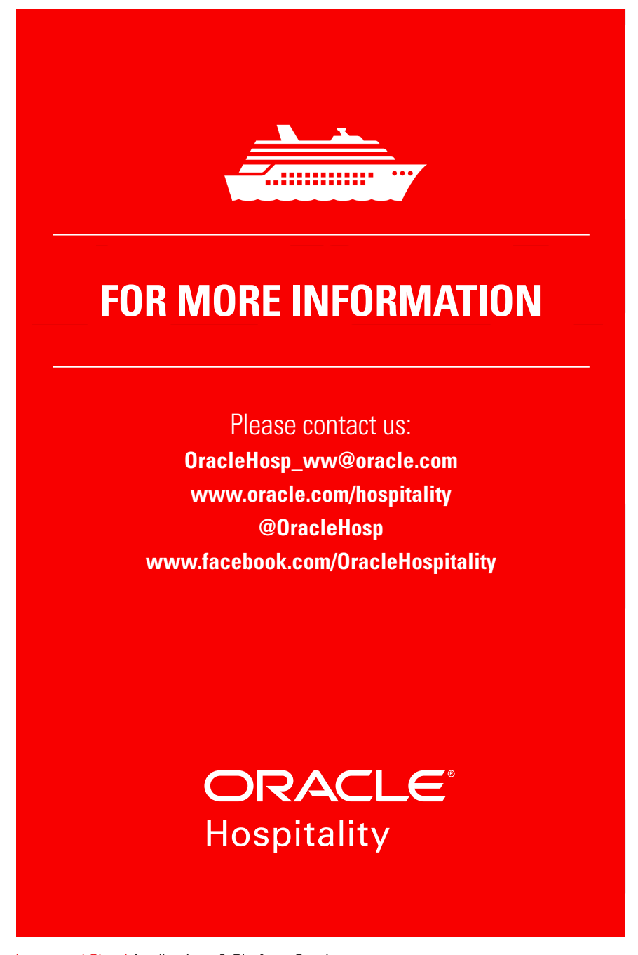
Integrated Cloud Applications & Platform Services

Copyright © 2018, Oracle and/or its affiliates. All rights reserved. This document is provided for information purposes only, and the contents hereof are subject to change without notice. This document is not warranted to be error-free, nor subject to any other warranties or conditions, whether expressed orally or implied in law, including implied warranties and conditions of merchantability or fitness for a particular purpose. We specifically disclaim any liability with respect to this document, and no contractual obligations are formed either directly or indirectly by this document. This document may not be reproduced or transmitted in any form or by any means, electronic or mechanical, for any purpose, without our prior written permission.