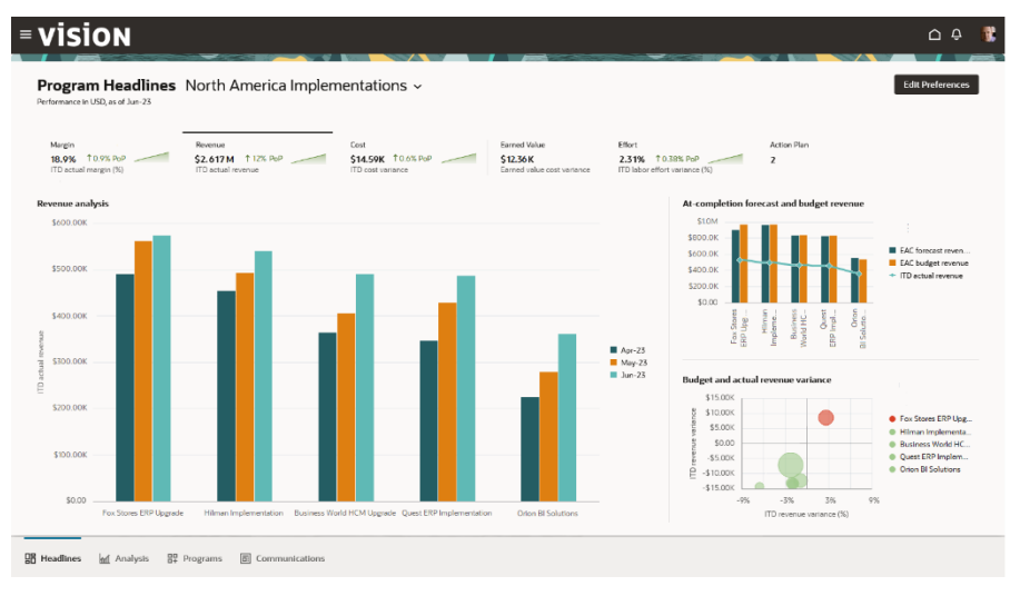
Figure 1. Program headlines give a complete view of performance against key measures

Potential problems are detected before they surface and decisions made with confidence, through tailored analysis which anticipates the business questions needing answers and complements the organization's program management approach.