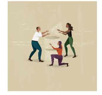
Oracle Fusion Cloud Project Management is a single, intelligent, enterprise solution that works with finance, HR and operations to improve project delivery and profitability.

Program managers spend less time looking for issues and more time mitigating risk with real-time performance insight at their fingertips.