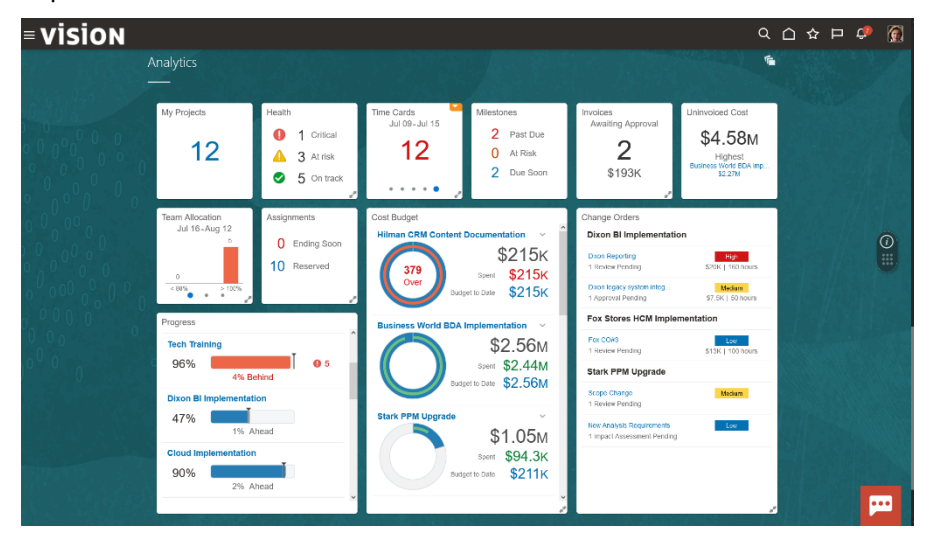
Figure 2. Intuitive, actionable project insight is delivered through an easy-to-use dashboard

Project managers face increased pressure for faster delivery and smarter decision-making and require rapid reliable information for project success. Oracle Project Management proactively helps project managers get answers to their business questions and take action in real time, through self-monitoring, actionable project intelligence. With early insight into items requiring attention such as missing timecards, milestones at risk, or project assignments ending soon, project stakeholders elevate their focus to a more strategic level and are empowered to proactively drive broader performance improvements across the board.