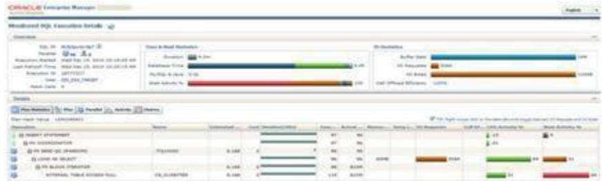
Figure 2: Enterprise Manager Cloud Control Integration