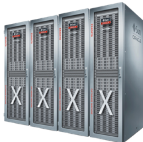
Fig. 1: Elastic Scale-out to Multi-rack Exadata

Exadata supports multiple racks to be connected using the integrated InfiniBand fabric to form even larger configurations. For example, a system composed of four Full Racks is simply four times as powerful as a single rack system – providing quadruple the I/O throughput, quadruple the storage capacity, and quadruple the processors. It can be configured as a large single system or logically partitioned for consolidation of multiple databases. Scaling out is easy with Exadata Database Machine. Oracle Real Application Clusters (RAC) can dynamically add more processing power, and Oracle Automatic Storage Management (ASM) can dynamically add more storage.