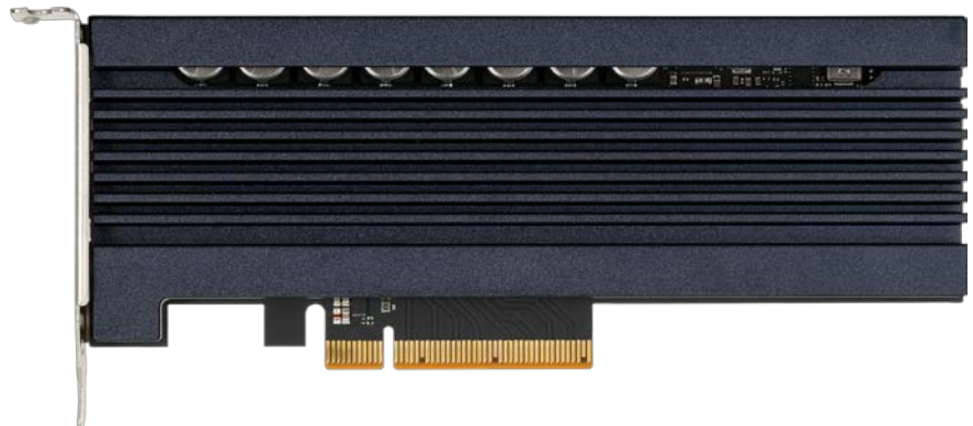
Fig. 2: Flash Accelerator F320 PCIe Card

Exadata Extreme Flash (EF) Storage Server , first introduced with Exadata X5, is the foundation of a database-optimized all-flash Exadata Database Machine. Exadata X6 enhances previous generation EF Storage Servers, by doubling the flash capacity. Each EF Storage Server contains eight 3.2 TB state-of-the-art Flash Accelerator F320 PCI flash drives, offering 25.6TB raw flash capacity per EF Storage Server. For the first time in the database industry, Exadata introduces flash drives based on 3D V-NAND technology. 3D V-NAND is a unique innovation in Flash semiconductor technology that leads to improved speed, power efficiency and endurance compared to previous generations of Flash. In addition, Exadata delivers ultra-high performance by placing the flash drives directly on the high speed PCI bus rather than behind slow disk controllers and directors. Finally, Exadata flash uses the latest NVMe (Non-Volatile Memory Express) flash protocol to achieve extremely low I/O overhead.