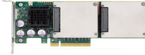
Sun Flash Accelerator F80 PCIe Card

Exadata flash can be used directly as flash disks, but it is almost always configured as a flash cache in front of disk since caching provides flash level performance for much more data than fits directly into flash.