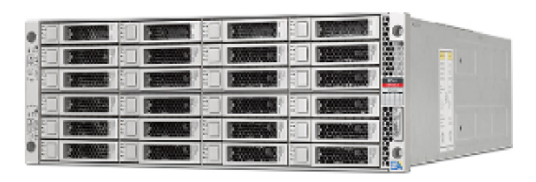
Figure 1 - Oracle Database Appliance System

Oracle Database Appliance is a pre-configured, highly available Oracle database system. It is a complete system that includes hardware, software, networking, and storage, all packaged in a single 4-U rack installable box. The hardware configuration provides complete redundancy and protects against all single points of failures in the system.