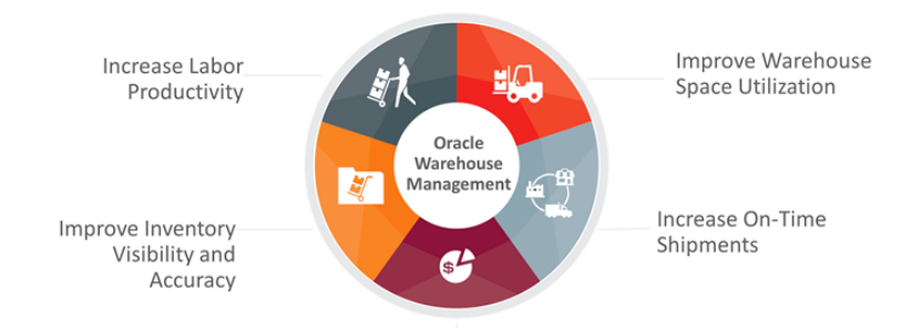
Reduce Fulfillment Costs

Oracle® Warehouse Management (WMS) enables companies to maximize their labor and space utilization and equipment investments by coordinating and optimizing resource usage and material flows. Specifically designed to support the needs of distribution, manufacturing, asset-intensive, and service businesses, Oracle Warehouse Management provides a single-platform across an entire global supply chain.