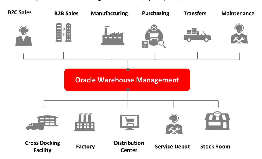
Figure 2: Any Flow, Any Facility, Any Type of Business

With Oracle Warehouse Management customers require only a single, global warehouse management solution for all aspects of business including distribution, discrete & process manufacturing, maintenance, spare parts, and field service.