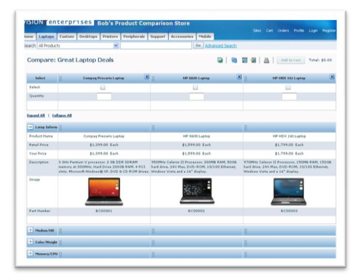
Figure 3. Showcase products and offerings to meet unique branding needs

iStore leverages Oracle's unified Customer Master to target each customer with the right combination of products, prices, and promotions. This advanced customer model allows you to segment customers and analyze buying patterns to further personalize interactions and content. Through seamless integration with Oracle Marketing, iStore can provide even more sophisticated personalization. This combination enables marketers to cross-sell and up-sell related products and make additional offers based on predictive models of an iStore customer's propensity to buy.