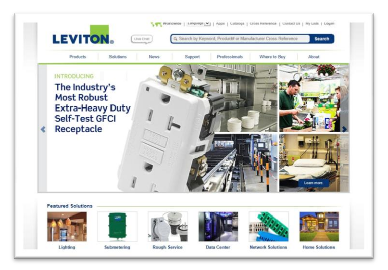
Figure 4. Name brand customers choose iStore to drive their sales