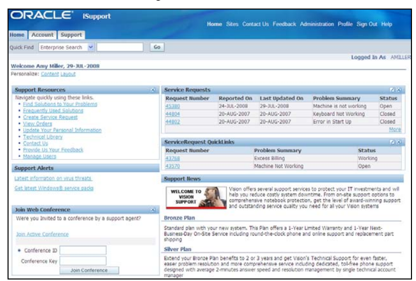
Figure 1: iSupport provides 24/7 personalized self-service for your customers and employees

Whether customers need answers to the product questions at 3 A.M. or need to initiate a return, self-service Web support is the most direct path for them and the lowest-cost service channel for you. Oracle iSupport provides a secure, 24/7 Web portal for self-service support for different types of users—guests, customers, and employees. Customers can easily search the online knowledge base, or learn from other users through online forums. Personalized announcements on the home page keep them informed about the latest support news, upgrades, and recalls that apply to products they own. Self-service account management and returns are convenient for your customers and drive down your support costs. Contextual cross-sell and up-sell capabilities turn service interactions into revenue opportunities. Integration with Oracle TeleService makes it possible for an agent to step in and provides live assisted service. The result: higher customer satisfaction at a lower service cost.