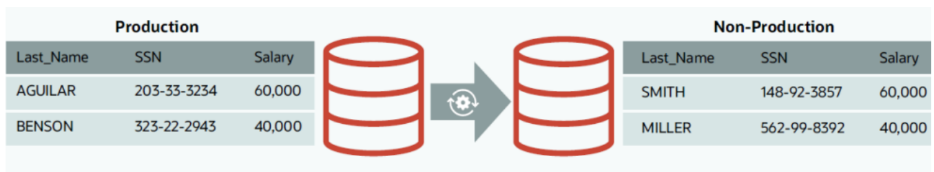
Figure 1. Overview of Data Masking

Oracle Data Masking and Subsetting improves security by reducing the exposure of sensitive data in non-production environments. Data Masking and Subsetting extracts entire copies or subsets of application data from a database and masks sensitive data so it may be safely shared to support activities such as software QA and business analysis. Masking can help reduce costs by keeping masked non-production databases out of the scope of compliance audits.