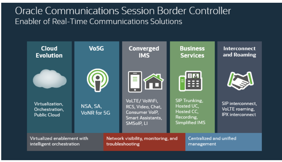
Image 1. Enable Real-Time Communications Solutions with Oracle Communications Session Border Controller.

Oracle Communications Network Learning Subscription / Version [1.0] Copyright © 2024, Oracle and/or its affiliates / Public