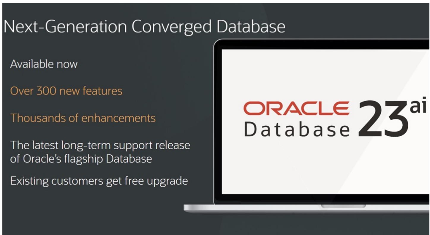
Figure 2. Oracle Database 23ai Overview

More specifically, Oracle is delivering the following distinctive capabilities (see Figure 2):