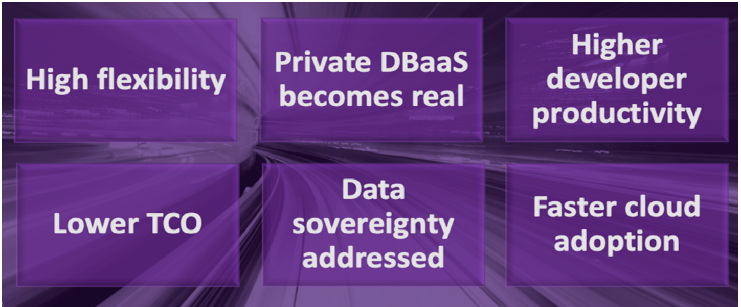
Figure 3. Six Market Value Drivers of Multi-VM Autonomous Database on Exadata Cloud@Customer