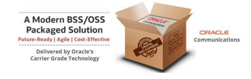
Image 1. DBX is a BSS/OSS packaged solution delivered on Oracle technology by Oracle

Oracle Digital BSS Express (DBX) is a modern, pre-integrated, and extensible BSS/OSS solution delivered on Oracle's carrier-grade technology by Oracle Customers Solutions for Industries – Communications (CSI-Communications). The prebuilt order-to-cash solution implements industry best practice business processes.