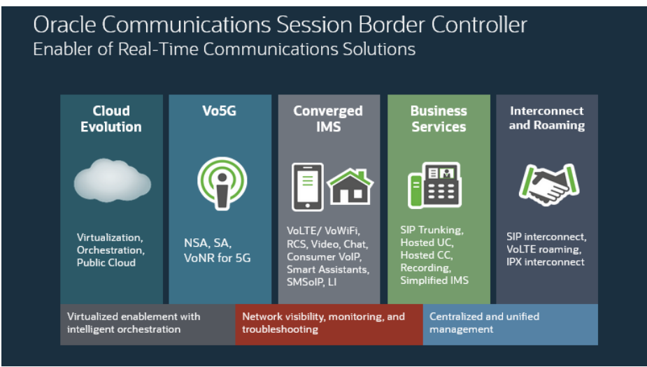
Image\ 1.\ Enable\ Real-Time\ Communications\ Solutions\ with\ Oracle\ Communications\ Session\ Border\ Controller.