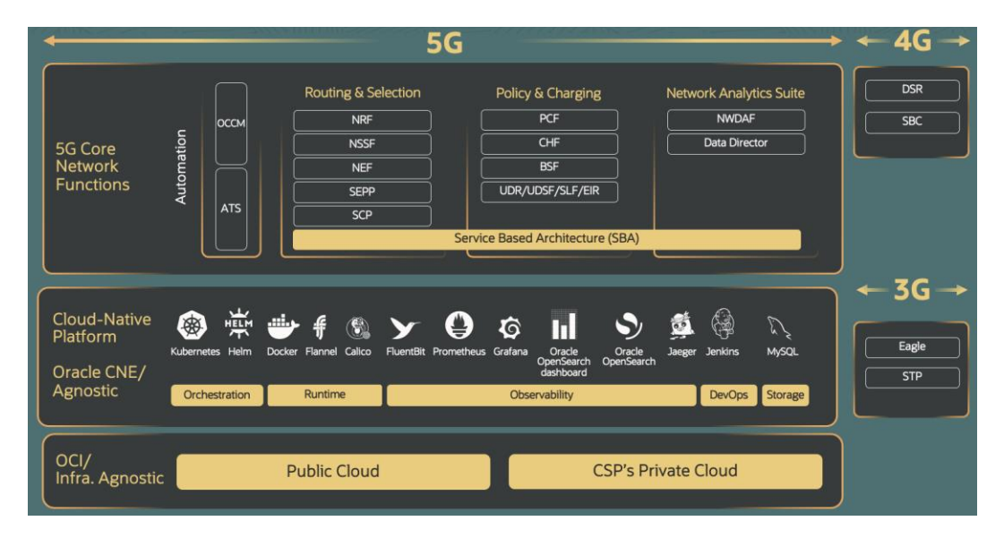
Image 2. Oracle Communications Cloud Native Core Network Functions Deployment Stack.

Deploy trusted, cloud native 5G technology from the network through BSS and OSS applications. Take advantage of automation in the 5G standalone core to bring new services to market faster.