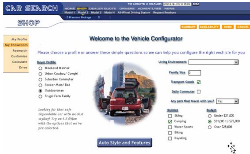
Figure 2: Oracle Configurator guides the customer to the best selection

With Oracle Configurator, customers can configure complex custom products and services that meet their needs. Through an interactive guided selling session, customer requirements are gathered and mapped to a set of product options. As the customer provides information, follow-on questions and options are focused to include only the choices that fulfill customers' requirements. During the configuration session, the interactive engine provides real-time feedback, ensuring that valid solutions are provided.