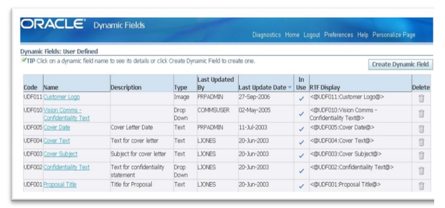
Figure 2. Turn proposal content into a professionally formatted document with one click

Salespeople are often forced to waste time re-entering information that already exists in the company's Sales Force Automation system. Oracle Proposals solves this problem by creating a proposal directly from the opportunity. The application copies relevant information such as customer name and contact directly from the opportunity, eliminating the need for redundant data entry.