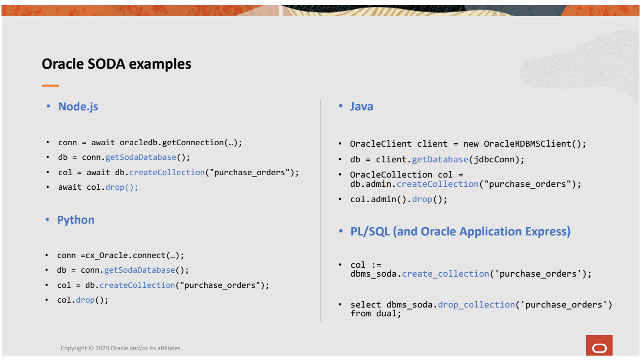
Figure 3. How Oracle SODA Plugs into Important Popular Programming Languages

But this is only half the story: The main value of Oracle Autonomous JSON Database is that it runs on Oracle Autonomous Database, which means that it has all the self-driving automation, availability, scalability, elasticity and pay-per-use model of the Oracle autonomous platforms. Oracle provides the availability that enterprises need for their JSON-centric next-generation applications as well as the scalability and elasticity that JSON-native applications need. Practically, this means developers do not have to worry about taking care of database management (new instance provisioning, automated backup, replication, disaster recovery, scaling and tuning, and so on), and with that they can avoid