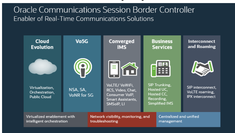
Image 1. Enable Real-Time Communications Solutions with Oracle Communications Session Border Controller.