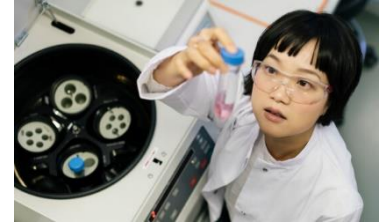
Accelerate your business

Gain the competitive edge, win more business, and execute more clinical trials efficiently and cost effectively with the new Oracle Life Sciences CRO Growth Initiative.