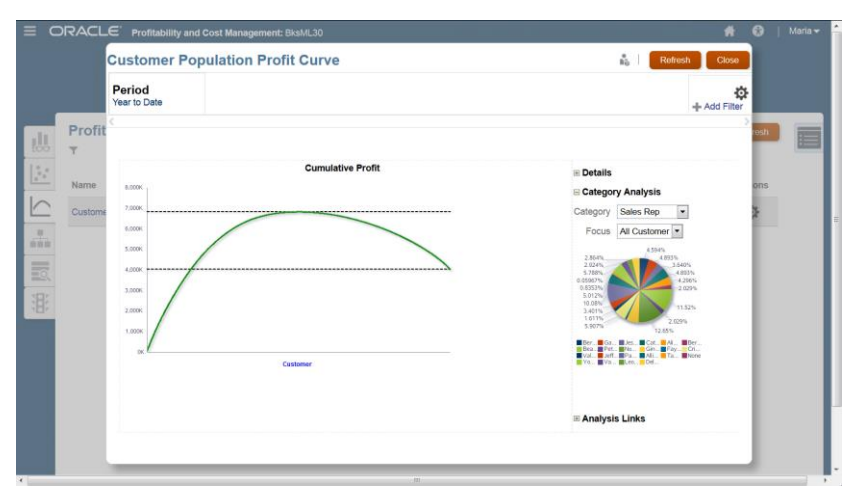
The 'profit curve' report is a pre-built analytical tool in Profitability and Cost Management providing analysis of profitability across an entire business dimension – such as customer, product, market, etc.

The "profit curve" report shown in figure 3 is a good example. The vertical axis represents net profitability, and the horizontal axis represents the business dimension (e.g. customer, product, channel, sales person, zip code, etc.). Data points are sorted from left to right on the axis, showing the most to the least profitable members (in this case, customers). The report can be further enriched by combining it with operational data parameters such as 'salesperson by product' or 'sales channel by product'. These parameters enable queries such as, show 'Top 20% most profitable customers by sales person' or 'Bottom 20% customers by sales person', thereby providing actionable insight to profitability. There are many other scenarios and parameters that can be used to deliver value to any business processes or business unit.