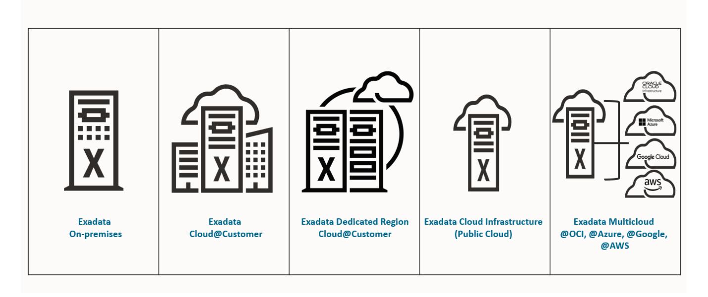
Figure 4 Exadata advantages are available on-premises and in public clouds with 100% compatibility

With Exadata Cloud Infrastructure, customers run Oracle databases on Exadata in Oracle's public cloud (OCI) with the same exceptional performance and availability enjoyed by thousands of organizations deploying Exadata on-premises. Customers can also run Oracle databases on Exadata in other partner clouds (Microsoft Azure, Google Cloud, or Amazon AWS) with the same exceptional performance as other Exadata deployments.