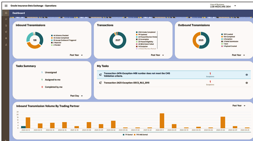
Figure 1: DECS Operations Workbench Dashboard

Business users have access exception workflow tasks in the Operations Workbench, which give them visibility and tools necessary to perform their job on one single platform. DECS allows business users the choice to accept or reject incoming files that fail threshold conditions (refer to figure 2 below), and edit and re-validate individual transactions. The remediated transactions are then routed to their outbound destination automatically.