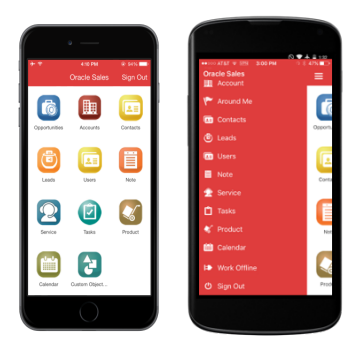
Figure 1: Oracle CRM On Demand Connected Mobile Sales

This add-on mobile service provides a configurable mobile solution on Android, and iOS devices. You can access data from CRM On Demand in real time with a rich, native user experience that is comfortable and familiar to current mobile users and fully configurable to capture your unique processes. In this release, the client has been enhanced so that Tasks can be marked as completed directly from list pages. Users can go directly to an Edit page of a record from a list page using the sliding gesture. Finally, the Recently Viewed list is synchronized between the CRM On Demand web application and Connected Mobile Sales.