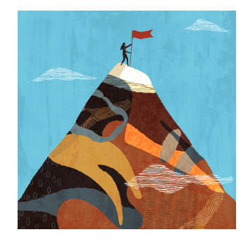
Oracle SFP improves outcomes for all stakeholders

Contextualizes for students at every stage of the financial aid process where they are, what needs to be done, and what is next, improving student experience, visibility, and satisfaction.