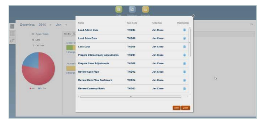
Manage the entire close process