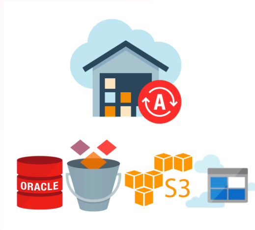
Figure 2. Analytic Freedom with Autonomous Data Warehouse

Oracle recently introduced the Autonomous Data Warehouse, a unique service that offers customers enterprise performance, reliability and security for their data warehouses, data marts and data lakes, with no administration support required. The Autonomous Data Warehouse is an easy to use service (e.g. it does not require manual intervention normally associated with data warehousing on-premises), it's fast (e.g. it runs on Oracle Exadata) and it's completely elastic (e.g. customers can independently scale compute and storage with zero downtime). The Autonomous Data Warehouse offers customers complete analytic freedom, with a choice of interfaces (e.g. SQL and APIs), analytic services (e.g. Machine Learning and Graph, and data management services (e.g. Autonomous Cloud and Object Stores). Therefore, customers have the ability to easily collect data from object stores in the Autonomous Data Warehouse, or easily connect to data resident in object stores for analytical purposes.