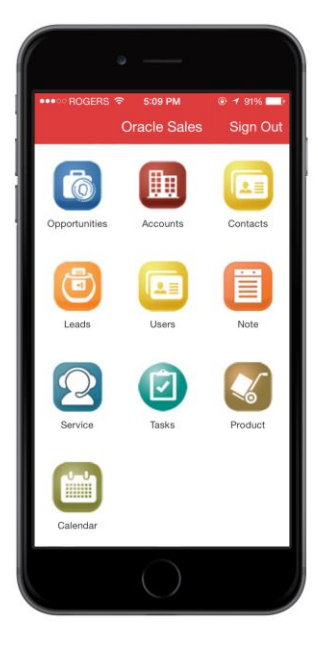
Figure 1: Mobile users can easily complete common activities, such as updating account information and creating follow-up tasks directly from their mobile device.