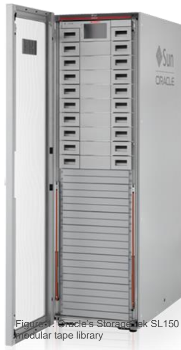
Figure 1: Oracle's StorageTek SL150 modular tape library

Essentially, for every additional exchange per hour beyond what the StorageTek SL150 already provides, the customer must pay an additional $1170 for the StorageTek SL500. Most growing businesses would not consider that an ideal investment.