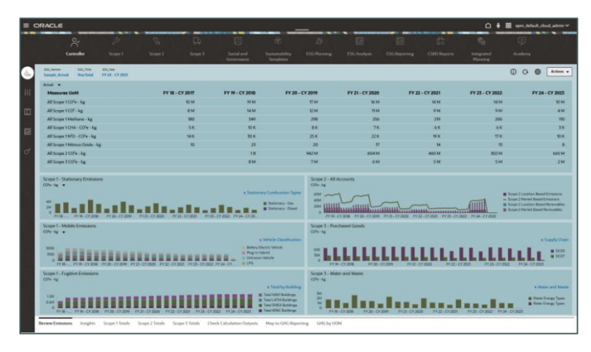
ESG dashboard showing social metrics

With environment, social and governance (ESG) reporting on top of the organizational agenda, you need a comprehensive solution that provides transparency to all stakeholders and regulators. Oracle Cloud EPM for Sustainability helps integrate financial and non-financial data to fulfill not just reporting requirements, but also helps you plan and manage your ESG practices, now and into the future.