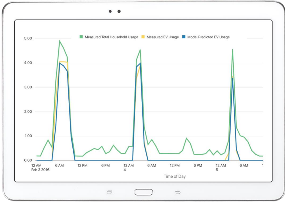
Figure 2: Oracle Utilities Analytics Insights deep learning algorithm disaggregates EV charging from whole home energy use, providing accurate accounts across the network of where and when EVs are charging as well as how much the EVs are impacting load demand.

Tapping deep machine learning, Oracle Utilities Analytics can identify the presence of an EV, show the time and frequency of charging, and disaggregate the energy being consumed from the vehicle with advanced metering infrastructure (AMI) data. With this insight, utilities can better plan for the demand growth needed to power EVs at scale, while engaging customers to charge at times that are the least expensive for them and best for the health of the energy grid.