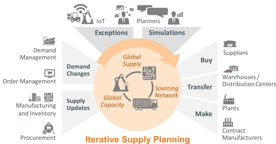
Figure 1. Quickly respond to changes in supply and demand across global networks

Today's supply chains are complex, with multiple tiers of internal and external nodes. You must plan for a global network of in-house production and distribution facilities, contract manufacturers, drop ship suppliers, and outside services providers. In addition, you may need to manage discrete, process, and configure-to-order manufacturing processes.