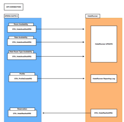
Figure 1. Used API services diagram

HotelRunner Inc. 2035 Sunset Lake Road, Suite B-2 19702 Newark, New Castle, DE United States