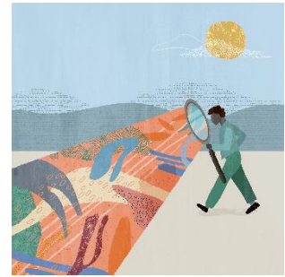
Enhanced invoice management through Optical Character Recognition

Corporates can use this platform to present, collect, reconcile, and report invoice data and to digitize their receivables solutions. The platform can help corporates identify ways to streamline their receivables.