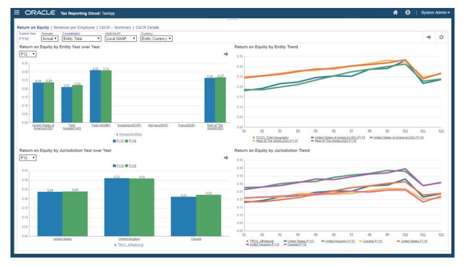
Figure 1. Configurable dashboards make it easy to quickly visualize key tax metrics

Many tax departments have found that stand-alone tax provision solutions or add-ons to their tax return software simply do not solve the data challenge. In fact, in many ways, these solutions further exacerbate the issue by replicating data and processes. This approach requires duplication of effort in managing the chart of accounts and legal entity structures, increases the likelihood that tax is working with stale data, and creates an artificial wall between book and tax processes. Instead, the tax function needs a tax reporting solution that is efficient, leverages existing process where possible, and provides tax with the necessary transparency into both book and tax data. Tax Reporting in Oracle Fusion Cloud EPM offers exactly this.